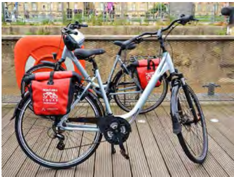
Bike – 21 gears