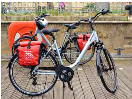
Bike – 21 gears