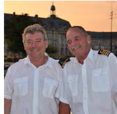
The two MS Bordeaux's captains

Length: 78m (256 ft.), Width: 9,80m (33 ft.), 49 cabins